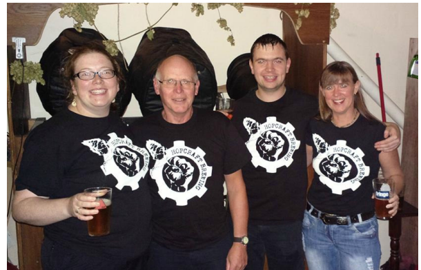
The Master and Social Secretary with friends at the Hopcraft brewery.