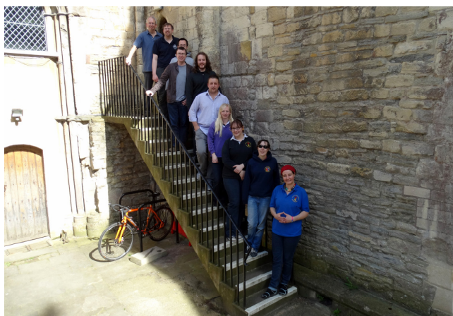
The band that represented the society in the Tewkesbury Shield

The Tewkesbury Shield was a particular highlight, when despite an early start to practice in Swindon, and a very long wait to ring last; we came 6 th out of nine teams, crucially beating the University of London society.